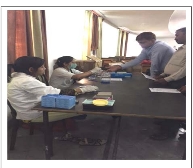
Blood sample collection