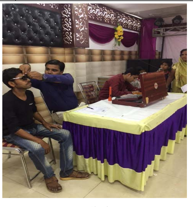
Eve Check up