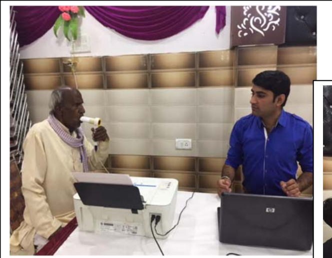
Pulmonary Function Test