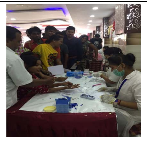
Blood Sample collection